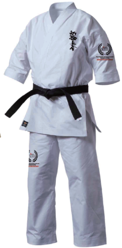
White/made in Japan