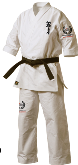
Ivory/made in Pakistan

Memorial Karate Dogi (Ivory/made in Pakistan) Price ¥12,540 (Tax included)